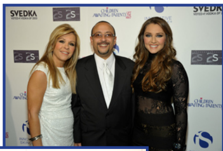
Leigh Anne Tuohy, Mark Soule & Collins Tuohy