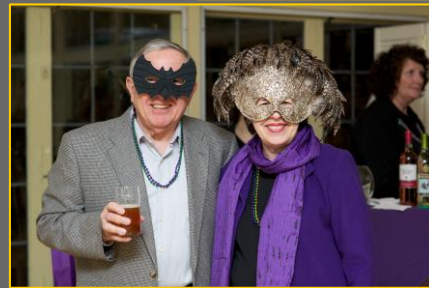
Mardi Gras